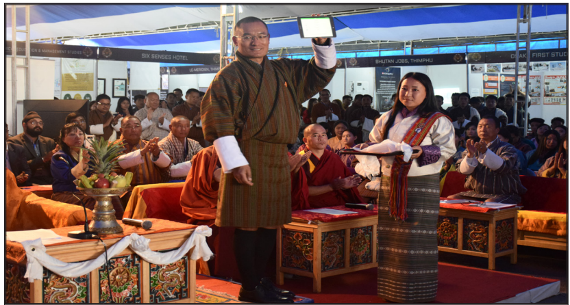
Launched the Bhutan JobSearch app by Hon'ble Prime Minister