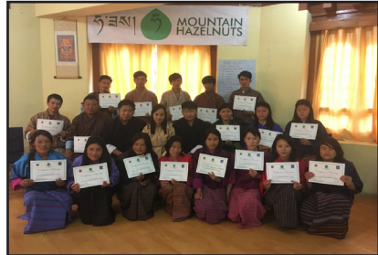
Participants who had undergone Hazelnut Entrepreneurship trainings in six dzongkhags