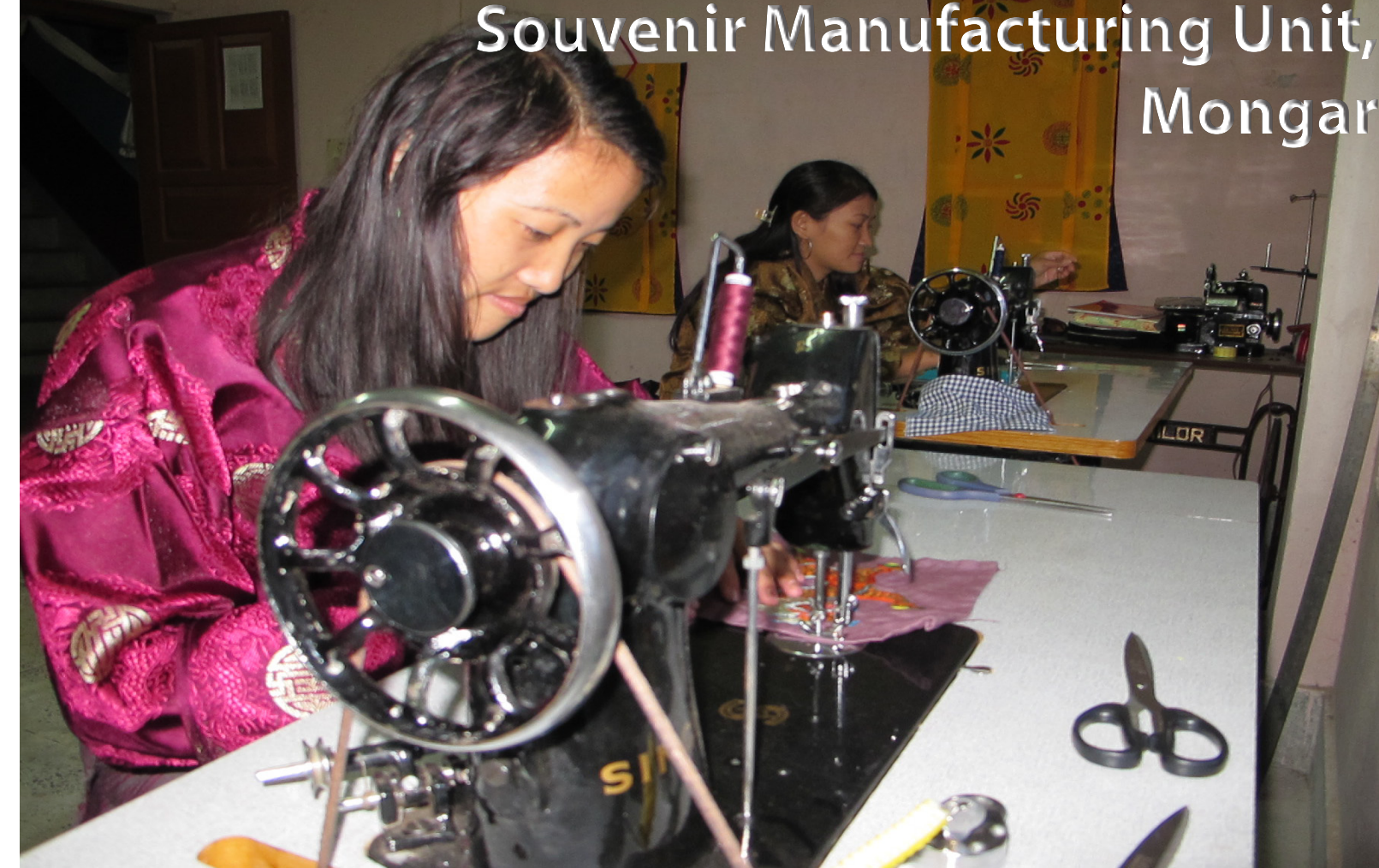
Souvenir Manufacturing Unit, Mongar

TEL: (975) 2-333867 FAX: (975) 2- 326731 Email: eship@molhr.gov.bt www.molhr.gov.bt