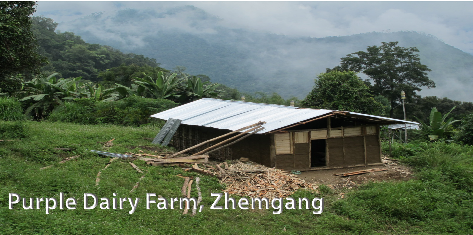
Purple Dairy Farm, Zhemgang