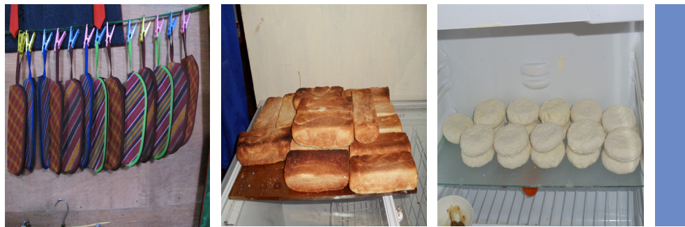
Products of IGSP beneficiaries